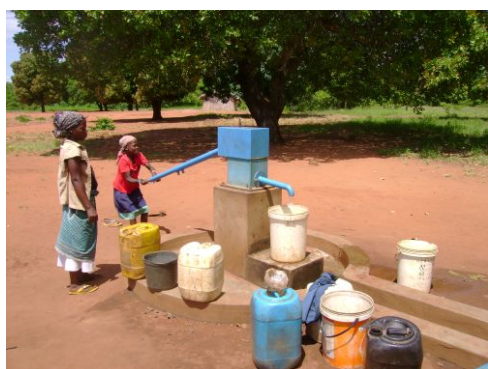
Bluepump at 65m deep on rehabilitated borehole, Unicef project Mozambique

For installation and maintenance, we recommend that a professional Regional Maintenance Team (RMT) is trained to assist communities with a yearly check-up and repairs in the unlikely case of a Murphy problem. This can be formalized in a maintenance contract for about 10 US$ per family per year, not including travel costs.