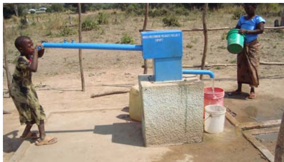
FairWater BluePump in UNDP Project Tanzania

In Africa, 1 out of 3 handpumps is not working anymore, over 150.000 handpumps are already abandoned. In areas with deeper groundwater often 4 out of 5 is not working. NGOs are trying to find solutions to stop wasting funds and trained more people and supplied more spare parts, but that did not solve the maintenance problems.